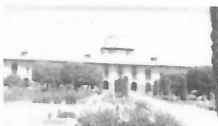
Rashtrapati Bhavan Entry