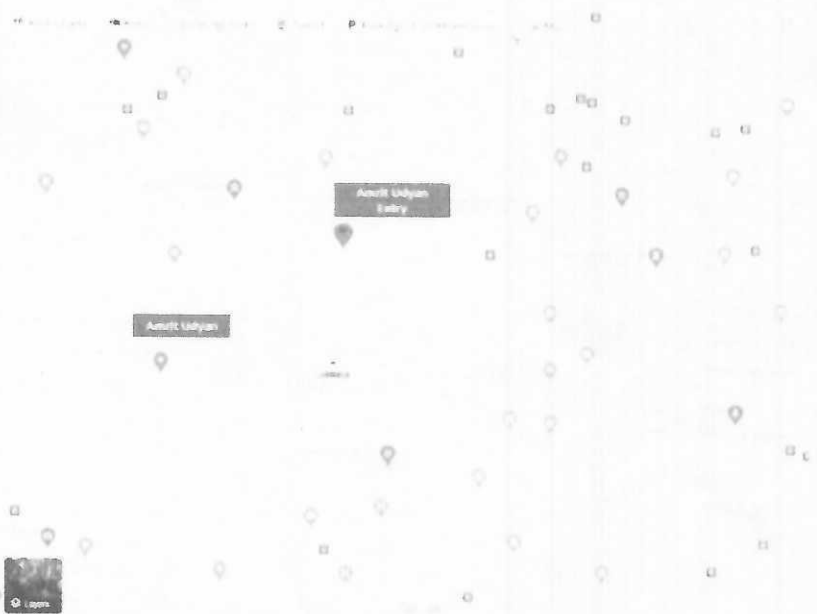
(Map with entry location at Gate 35 highlighted)